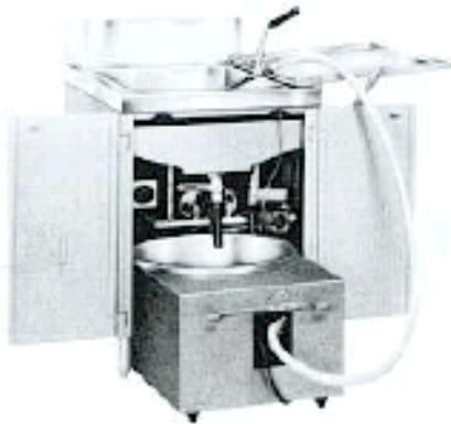
Anets CCF-150 Power Filter Stems Away Easily in Cabinet — See Bulletin #754.